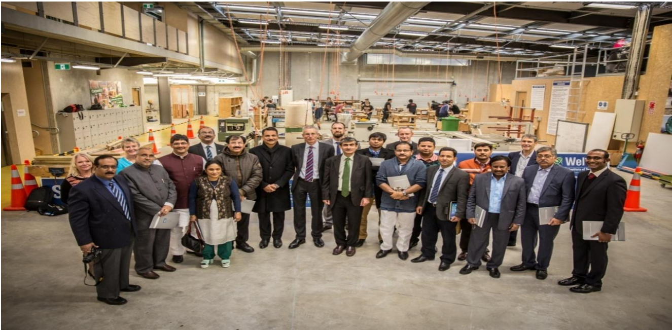
[Delegation at the Weltech Vocational Training and Polytechnic Institute in Wellington]

9.9. The Delegation visited Wellington from 2-4 June, 2015. The Delegation visited Weltech, Vocational Training and Polytechnic Institute. The delegation toured the training facilities available at the Institute for the construction and building industry, carpentry, electrical works, painting and construction of wooden homes by various categories of students at Weltec. 57% students were from India in Weltec.