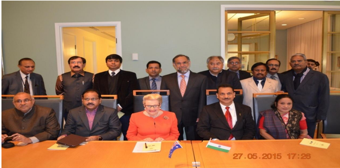
[Delegation called on Hon. Bronwyn Bishop, MP and Speaker of the House of Representatives in Canberra on 27.05.2015].

both countries had similar Parliamentary systems and also pointed out that the scale of democratic process in India was very large. MoS also mentioned about use of electronic voting machines to complete counting of votes in record time of few hours. MoS also elaborated upon the various Parliamentary procedures applicable in both Houses of Indian Parliament including the roles of the Speaker and Deputy Speaker and Panel of Chairmen. The delegation departed for Sydney on 29 th May, 2015.