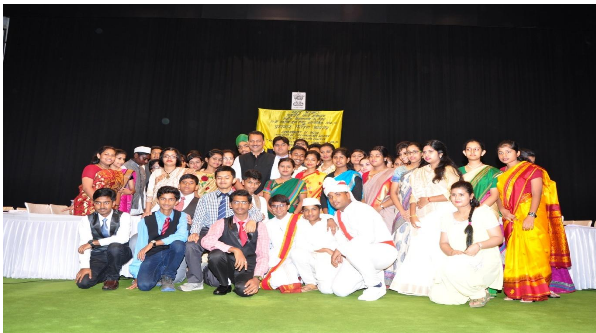
Shri Rajiv Pratap Rudy, Minister of State (Independent Charge) for Skill Development and Entrepreneurship & Minister of State in the Ministry of Parliamentary Affairs along with the Prize Winning students and teachers of Kendriya Vidyalayas on the occasion of Prize Distribution Function of 27 th National Youth Parliament Competition, 2014-15 held on 10 th July, 2015 at GMC Balayogi Auditorium, Parliament Library Building, New Delhi.

10.7 Prize Distribution function of the 27 th National Youth Parliament Competition, 2014-15 was held on 10 th July, 2015 at GMC Balayogi Auditorium, Parliament Library Building, New Delhi. Shri Rajiv Pratap Rudy, Minister of State (Independent) for Skill Development and Entrepreneurship & Minister of State in the Ministry of Parliamentary Affairs presided over the function and distributed the prizes. Four Kendriya Vidyalayas were awarded Zonal Winner Trophies for their meritorious performance in their respective zones and 20 Vidyalayas were awarded Merit Trophies for their outstanding performances at Regional Level. Besides, Certificates and individual prizes were also awarded to 950 prize winning students of the participating Kendriya Vidyalayas (750 students for their meritorious performances at Regional level and 200 students at National level).