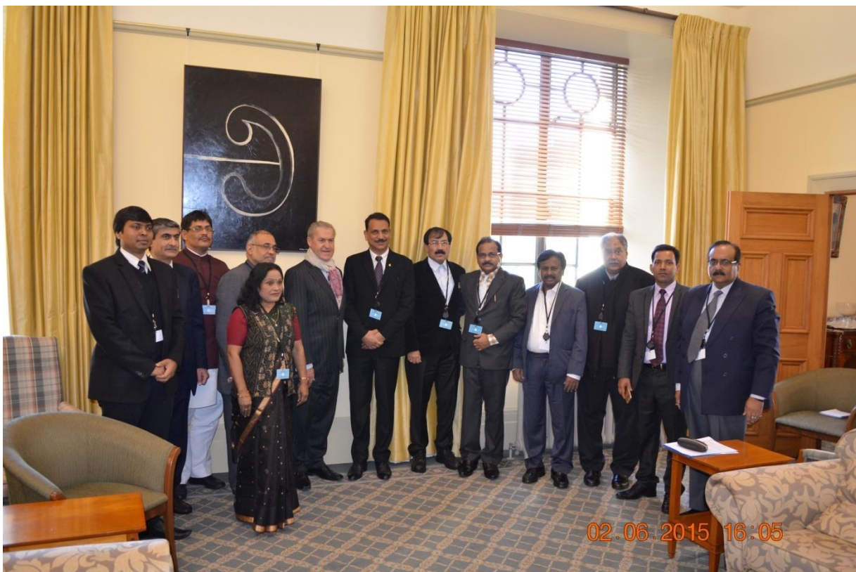
[Delegation called on Hon. David Carter, Speaker of New Zealand Parliament]

9.11. On 3 rd June, the delegation called on Hon. David Carter, Speaker of New Zealand Parliament . Speaker expressed satisfaction that the delegation would have had the opportunity to witness the New Zealand Parliament in Session during the Question Hour and to experience how the Westminster model of Parliamentary democracy was guiding the political processes in New Zealand and compare that with India. MoS endorsed the view that both countries had similar Parliamentary systems and also pointed out that the scale of democratic process in India was very large. MoS also mentioned about use of electronic voting machines to complete counting of votes in record time of a few hours. MoS also elaborated upon the various Parliamentary procedures applicable in both Houses of Indian Parliament including the roles of the Speaker and Deputy Speaker and Panel Chairman. The New Zealand Speaker then sought to emphasize on signing FTA between both the countries.