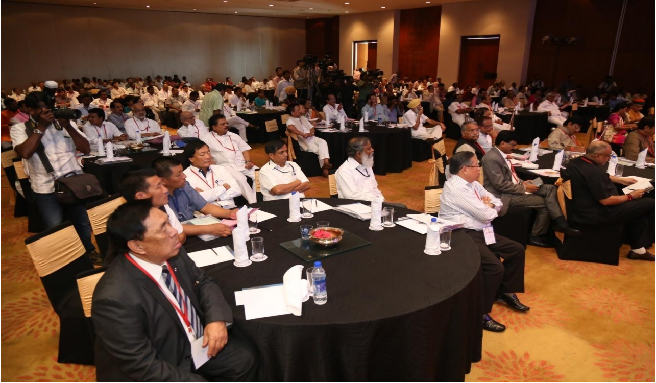
(Delegates attending 17 th All India Whips' Conference)