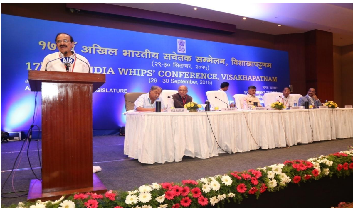
(Inaugural Address by Shri M. Venkaiah Naidu, Minister for Urban Development; Housing and Urban Poverty Alleviation and Parliamentary Affairs during 17 th All India Whips' Conference at Visakhapatnam)

12.11 The inaugural session was followed by discussion on the Agenda Items on 29 th -30 th September, 2015. The Conference deliberated and recommended on four issues namely the review of recommendations of 16 th All India Whips' Conference, setting up an independent Emoluments Commission, establishment of inter-party forums to resolve problematic issues and need to relook and overhaul the MPLADS. The recommendations of the Conference were presented and adopted unanimously in the concluding session on 30 th September, 2015. These recommendations aim at achieving uniformity in practices and procedures and improvement in the functioning of the Legislative Bodies in the country. The Conference expressed the view that these recommendations need to be considered and implemented expeditiously.