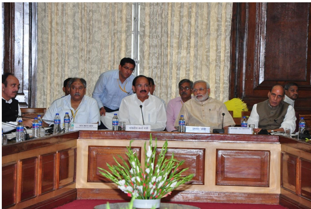
[All Party leaders meeting held on 20.07.2015 in room No. 63, Parliament House before the Monsoon Session of Parliament]