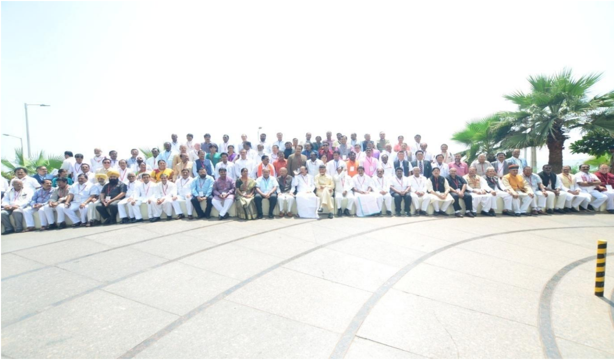
(Group Photograph of delegates attending the 17 th All India Whips' Conference)