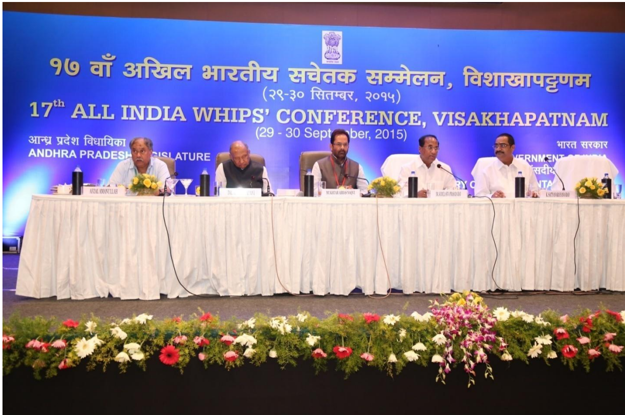
(Concluding Session of 17 th All India Whips' Conference on 30.09.2015)