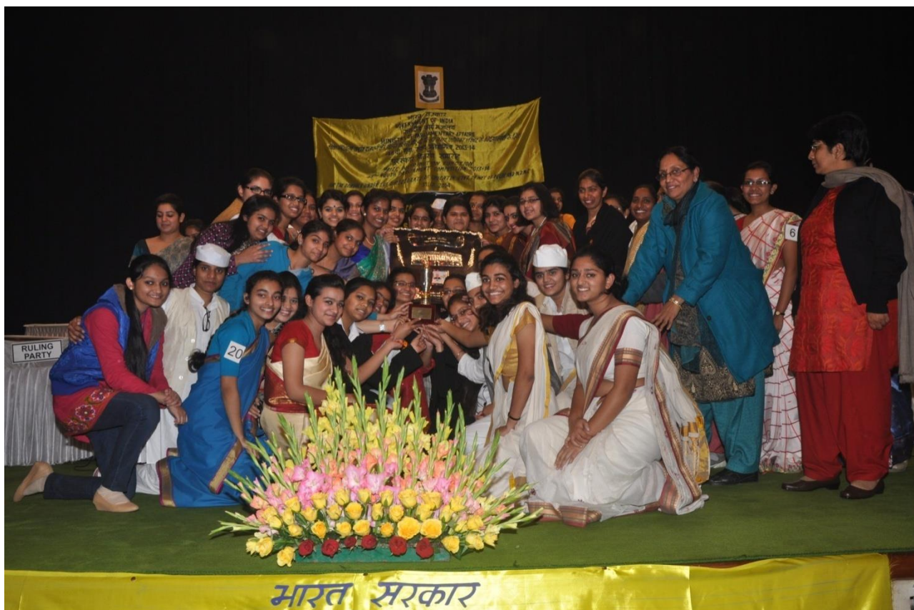
Prize winning students and teachers of Presentation Convent Senior Secondary School, Shyama Prasad Mukherjee Marg, Delhi-6 on the occasion of Prize Distribution Function of 48 th Youth Parliament Competition held on 31 st January, 2014.