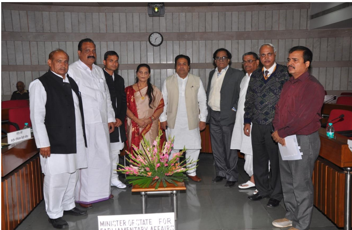
Shri Rajeev Shukla, Hon'ble Minister of State in the Ministry of Parliamentary Affairs and in the Ministry of Planning with the members of Hindi Salahkar Samiti during the meeting of the Hindi Salahkar Samiti held on 11 December, 2013

11.6 To ensure the implementation of the provisions of the Official Language Act and Official Language Rules and to keep a constant watch on the implementation of provisions related to the use of Hindi in the Ministry, the Sections of the Ministry are inspected. During the period under report, inspection of 5 Sections was carried out.