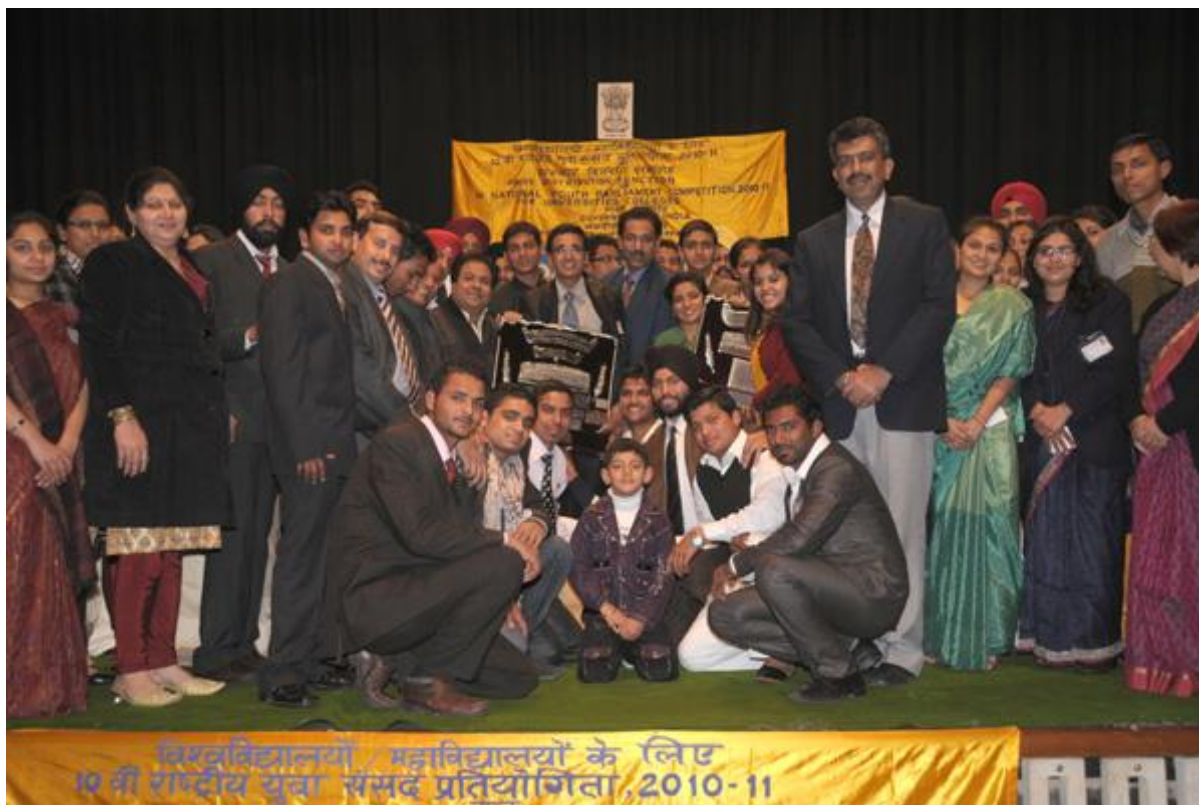
Shri Rajeev Shukla, Hon'ble Minister of State in the Ministry of Parliamentary Affairs alongwith the prize winning students of DAV College, Jalandhar (Punjab)