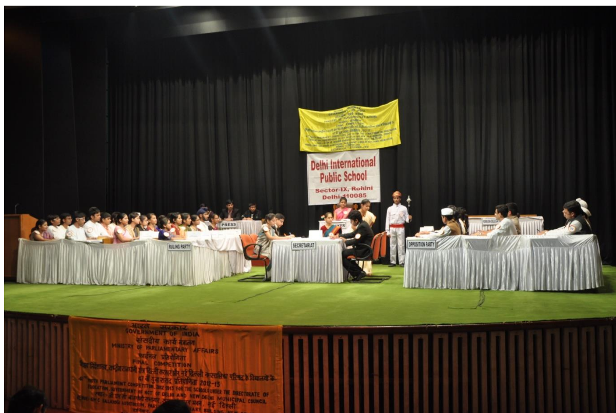
Stage performance by students of Delhi International Public School, Rohini, Delhi of 47 th Youth Parliament Competition 2012-13 on 15.12.2012 in GMC Balayogi Auditorium, Parliament Library Building, New Delhi.

10.3 Evaluation programme of 47 th Youth Parliament Competition was organized during the year amongst 33 Schools. The performance of 4 best Schools in order of merit was recorded by Lok Sabha/Rajya Sabha TV on 15 th December, 2012 in GMC Balayogi Auditorium, Parliament Library Building, New Delhi.