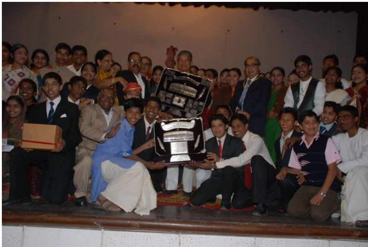
Shri Harish Rawat Minister of State in the Ministry of Agriculture, Minister of State in the Ministry of Food Processing Industries and Minister of State in the Ministry of Parliamentary Affairs alongwith the Prize winning students and teachers of Kendriya Vidyalaya, Pangode, Kerala on the occasion of Prize Distribution Function of 24 th National Youth Parliament Competition held on 15-02-2012.

10.6 Prize Distribution function of the 24 th National Youth Parliament Competition was held on 15 th February, 2012 at Mavalankar Auditorium, Rafi Marg, New Delhi. Shri Harish Rawat, Minister of State in the Ministry of Parliamentary Affairs and Agriculture, Food Processing Industries presided over the function and distributed the prizes. Kendriya Vidyalaya, Pangode, Kerala which stood first in the competition, gave a repeat performance of their sitting of Youth Parliament and was awarded “Pandit Jawahar Lal Nehru Parliamentary Running Shield” and a trophy for being first in the competition. Five Kendriya Vidyalayas were awarded Zonal First Trophies for their meritorious performance in their respective zones and 12 Vidyalayas were awarded Merit Trophies for their outstanding performances at Regional Level. Besides, Certificates and individual prizes were also awarded to 739 prize winning students of the participating Kendriya Vidyalayas (540 students for their meritorious performances at Regional level and 199 students at National level).