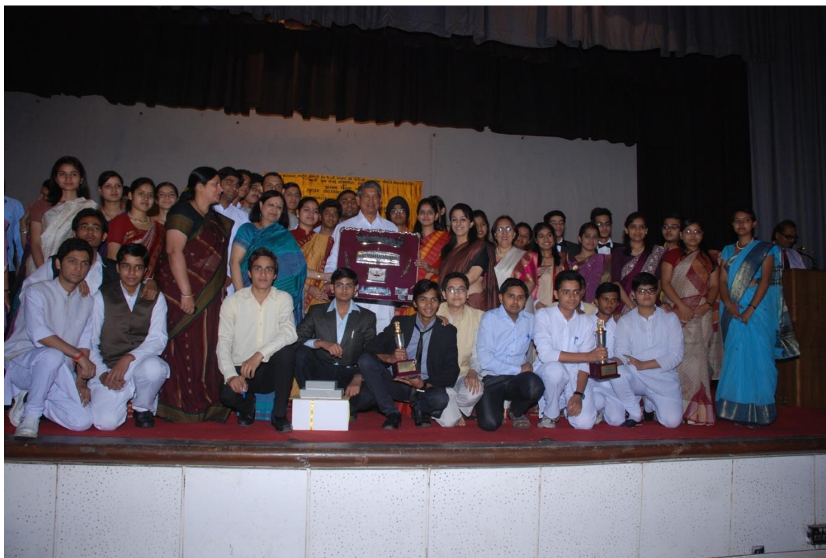
Shri Harish Rawat Minister of State in the Ministry of Agriculture, Minister of State in the Ministry of Food Processing Industries and Minister of State in the Ministry of Parliamentary Affairs alongwith the Prize winning students and teachers of SSLT Gujarat Sr. Secondary School, Raj Niwas Marg, Delhi – 54 on the occasion of Prize Distribution Function of 46 th Youth Parliament Competition held on 26-04-2012.

10.4 Prize Distribution function of the 46 th Youth Parliament Competition was held on 26 th April, 2012 at Mavalankar Auditorium, Rafi Marg, New Delhi. Shri Harish Rawat, Minister of State in the Ministry of Parliamentary Affairs and Agriculture, Food Processing Industries presided over the function and distributed the prizes. SSLT Gujarat Sr. Secondary School, Raj Niwas Marg, Delhi - 54 which stood first in the competition, gave a repeat performance of their sitting of Youth Parliament and was awarded “Pandit Moti Lal Nehru Parliamentary Running Shield” and a trophy for being first in the competition. The Trophy for standing first among the new entrants schools for 46 th Youth Parliament Competition was also awarded to SSLT Gujarat Sr. Secondary School, Raj Niwas Marg, Delhi – 54. 8 Schools were awarded the trophies for their meritorious performances in 46 th Youth Parliament Competition. Besides, individual merit prizes were awarded to 256 students from 33 schools for their out standing performances. The District Trophy for the best Education District in the 46 th Youth Parliament Competition was awarded to District ‘North’.